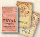
39 Tryal Cards