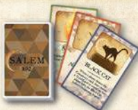
59 Salem Playing Cards