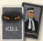
15 Kill Cards