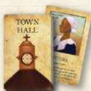
15 Town Hall Cards