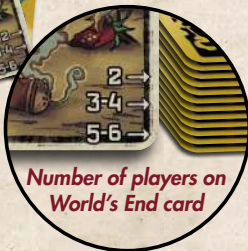
Number of players on World's End card