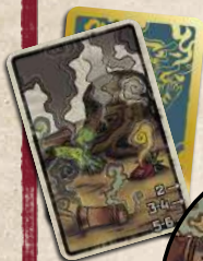
World's End card