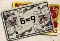
SPICE IT UP! cards